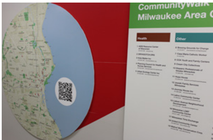
Figure 4. Close-up of QR code on physical map installation.

The students in this class replicated their virtual map with a physical map installation in the Department of Educational Policy & Community Studies, creating a recursive loop between a digital and physical artifact. The physical map included a large QR code (see Figure 4), allowing people viewing the physical installation to immediately navigate to the online map, and provided a graphic that mimicked the CommunityWalk webpage POIs. QR codes allow anyone with a smartphone to instantly connect to more detailed information on the web about a particular topic.