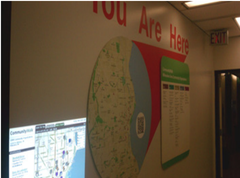
Figure 3. Photograph of physical map installation with online community walk projected on wall next to it in left-hand corner.

Efforts to map CBOs and visually describe information about their services and interrelationships are at the forefront of community informatics efforts nationally and internationally (e.g., Aronson, Wallis, O'Campo, & Schafer, 2007; Gwede et al., 2010). From a pedagogical perspective, Buxton (2011) suggests that "transmedia" applications involving location awareness such as the one developed by these students have "trickster" characteristics that can enable alternative ways of knowing, learning, and teaching. Buxton observes: